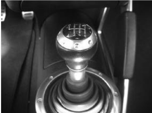
Step 1 Unscrew the existing gear knob