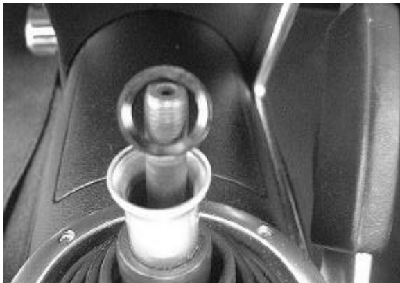
Step 2 If the plastic spacer ring has not remained attached to the gear knob, remove it from the shaft as per Step 3, You may need to prise it out with a screwdriver