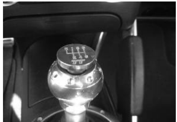
Step 5 Insert the top into the knob, suitably aligning the position. Once fitted, if the positioning is incorrect, the knob will have to be removed and the insert pushed out with a pen or similar implement from the inside.