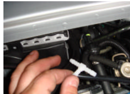
Fix "T" to Vacuum Hose