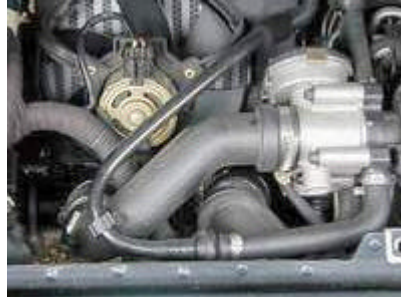
Loosen the clamps securing the intercooler pipe