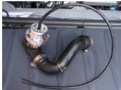
Fit new "T" piece and valve and fit vacuum hose to valve