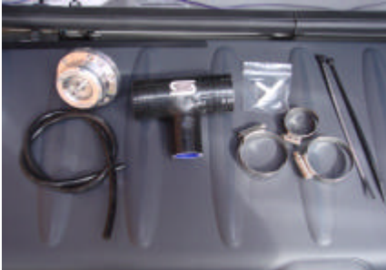
Forge dump valve kit as supplied