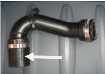
Remove the Hose from the hard pipe