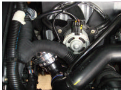
With the Valve installed tighten all clamps and secure the vacuum hose with the tie wraps supplied.