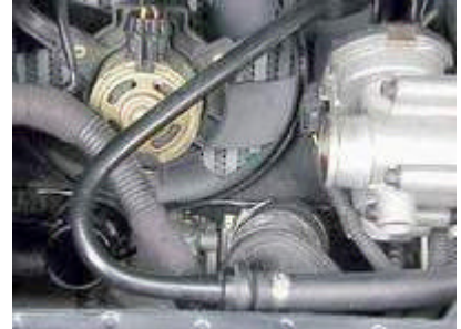
Remove the pipe