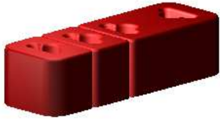
AUXILIARY VIEW (1 : 2)