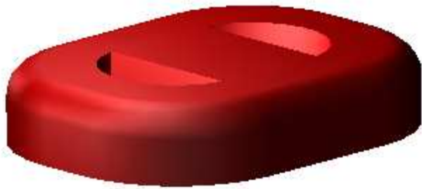
AUXILIARY VIEW (1 : 1)