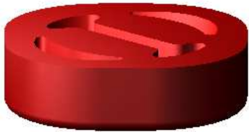
AUXILIARY VIEW (1 : 1)